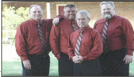
the FOUR-GIVEN Quartet

Aug 31 Matthew 16:21-28 Romans 12:9-21 "A Heavy Cross to Bear"