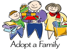
Adopt a Family