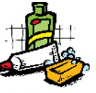
Toiletry Items Drive

Outreach Ministry We will have a box in the Narthex for toothbrushes and toothpaste. Please remember us when you are shopping each month. The SPY'S thank you! Here's the list for upcoming months: