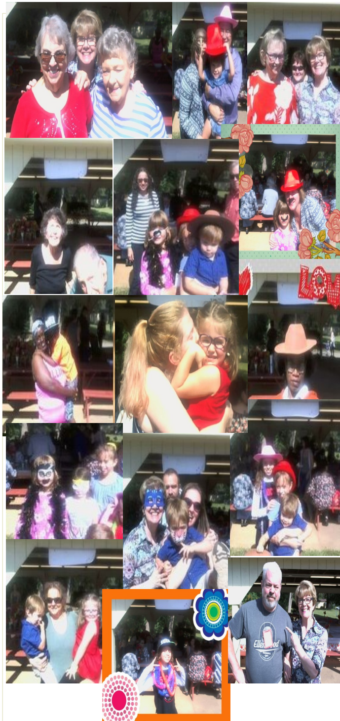
A few pictures from the photo booth at SPC's Fall Festival Picnic!

The Women's Bible Study group meets on the 1st, 3rd, 4th, and sometimes 5th Thursday of the month at 10:00 A.M. in the conference room.